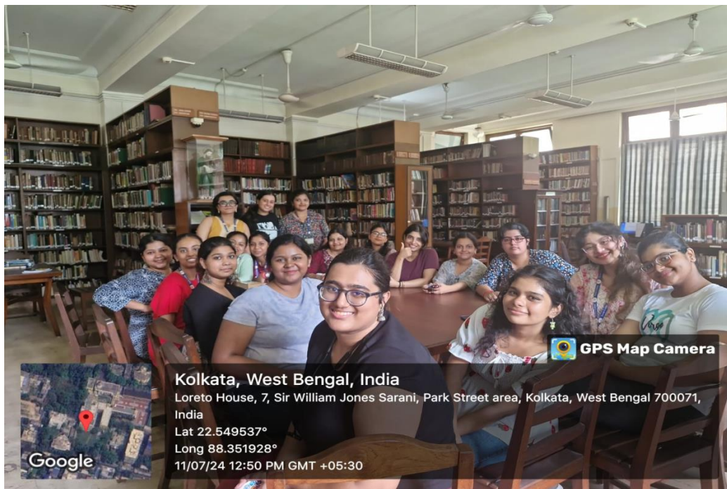
Book Club on July 11, 2024