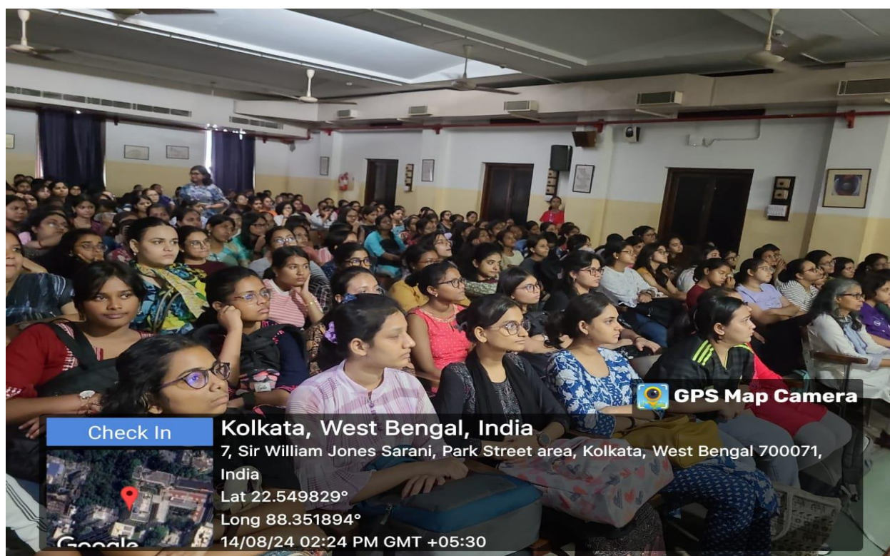
Library orientation for First Semester UG students