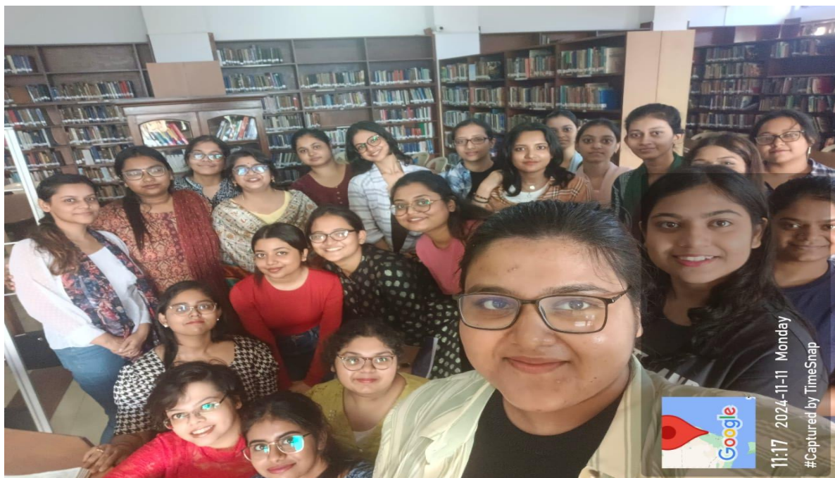
Library Orientation for First Semester Post Graduate English students