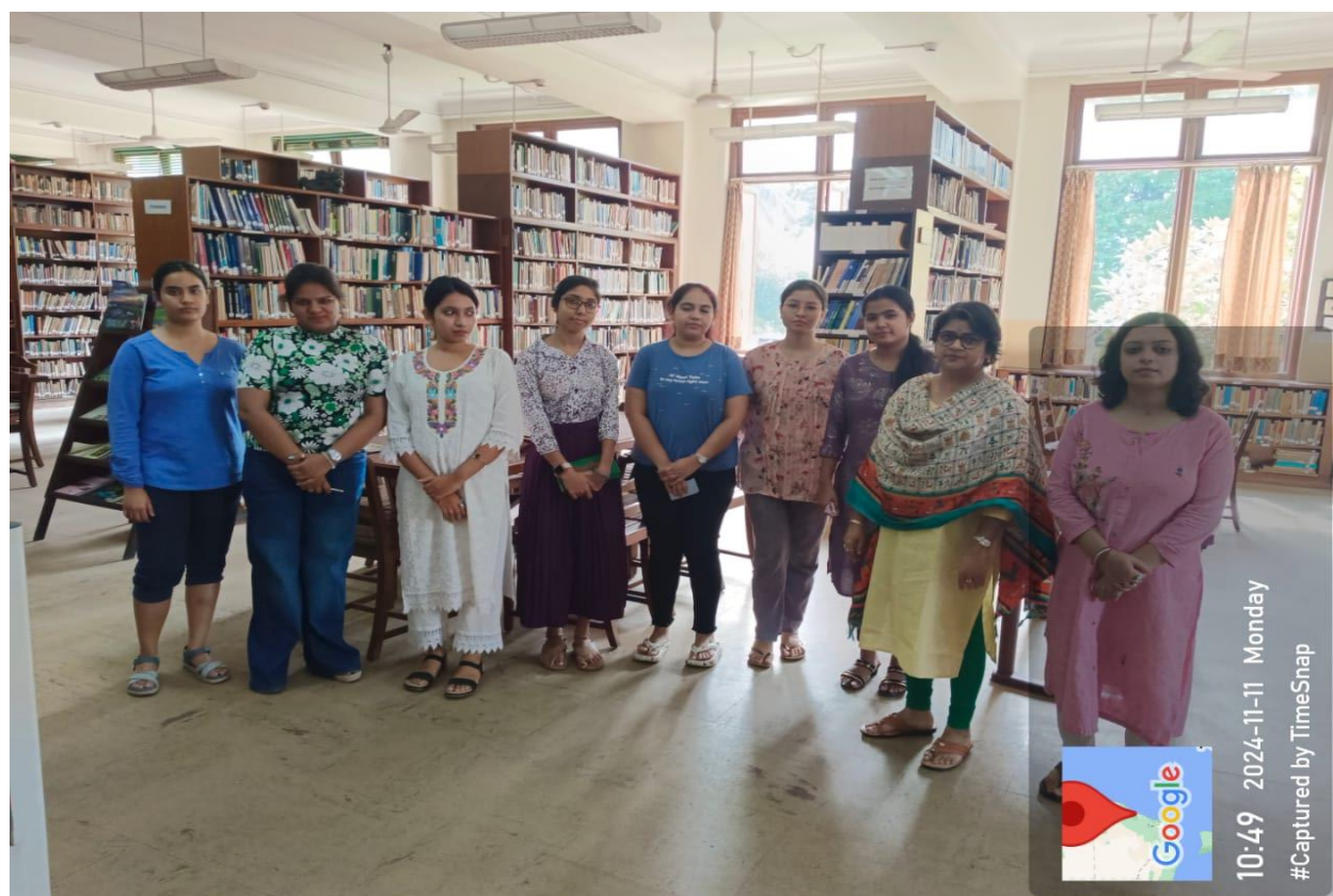
Library Orientation for First Semester Post Graduate Psychology students