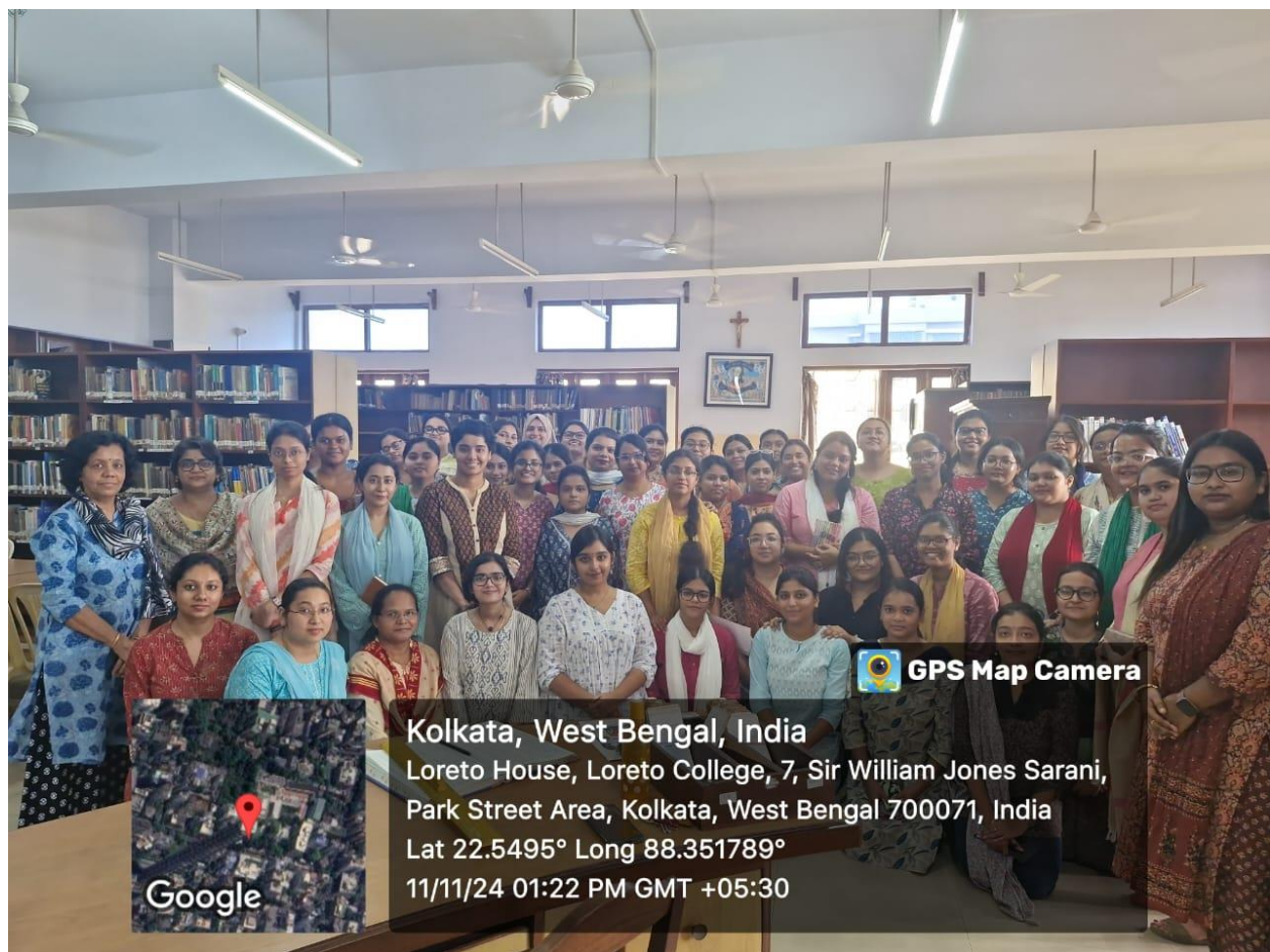
Library Orientation for First Semester B.Ed. students