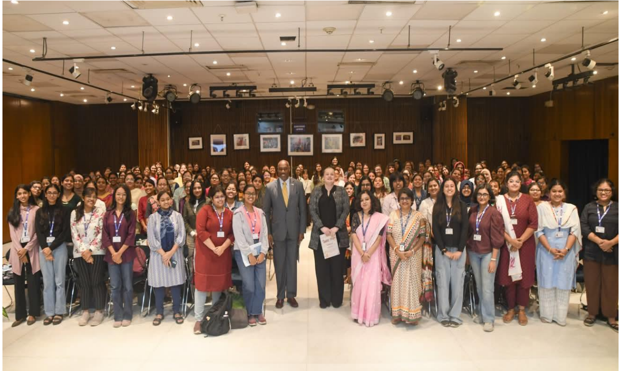
Our 150 students from the Under Graduate, Post Graduate (English) and B.Ed departments