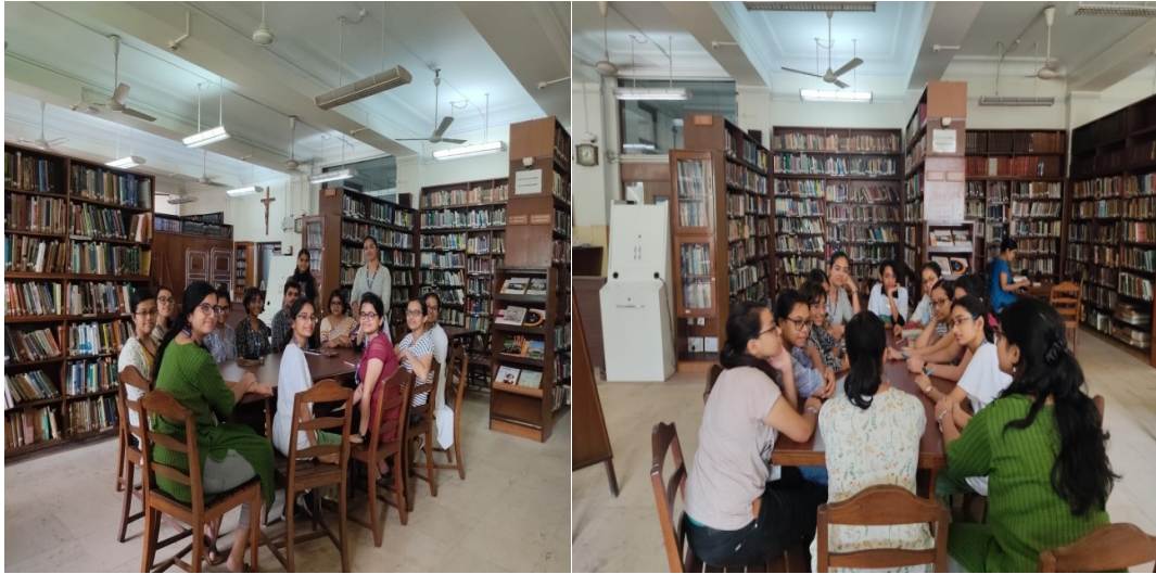
Book Club on September 16, 2022