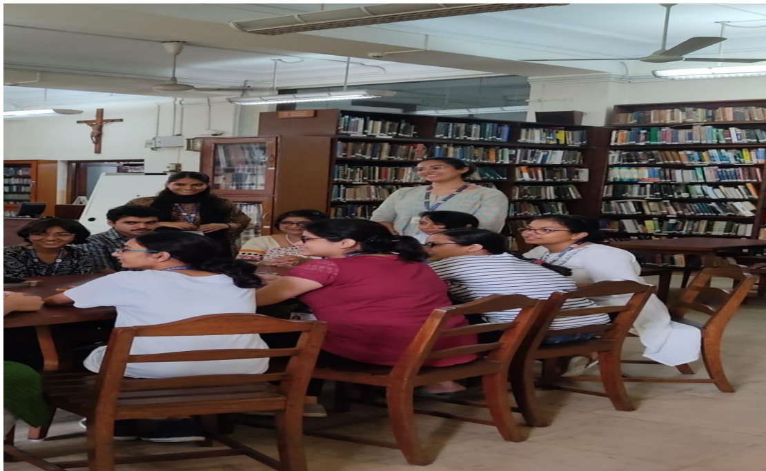
Book Club on December 20, 2022