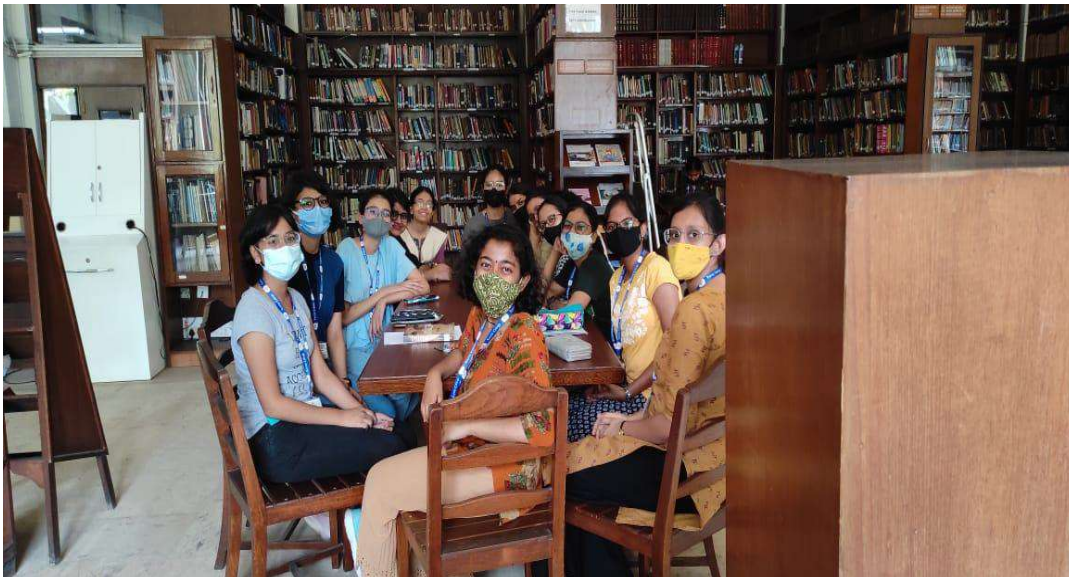
Book Club on December 07, 2022