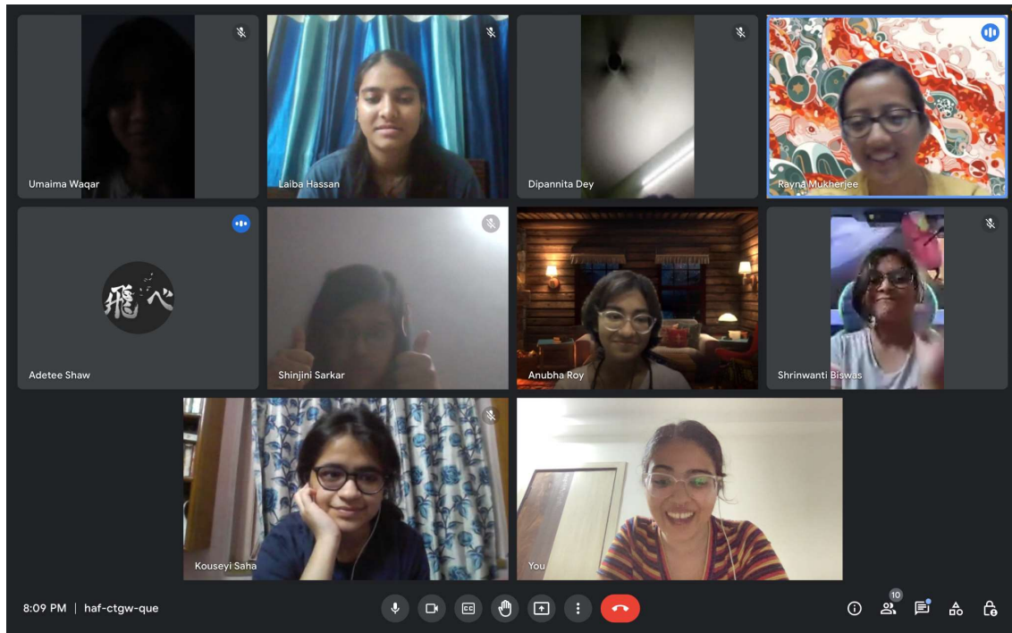
Online Book Club on September 27, 2022