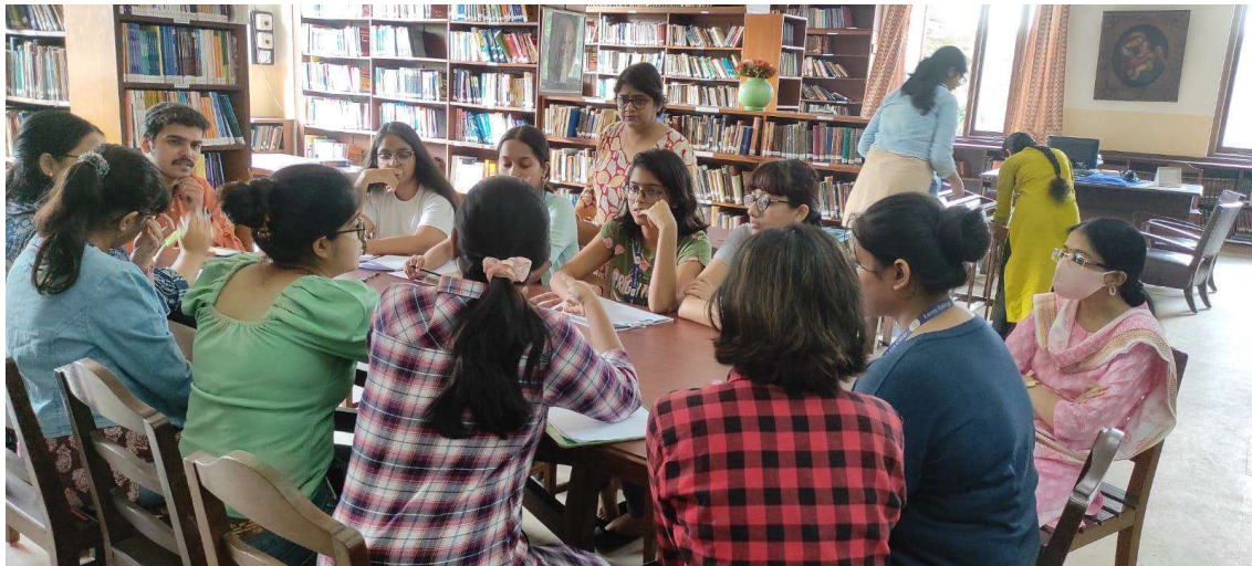
Book Club on November 10, 2022