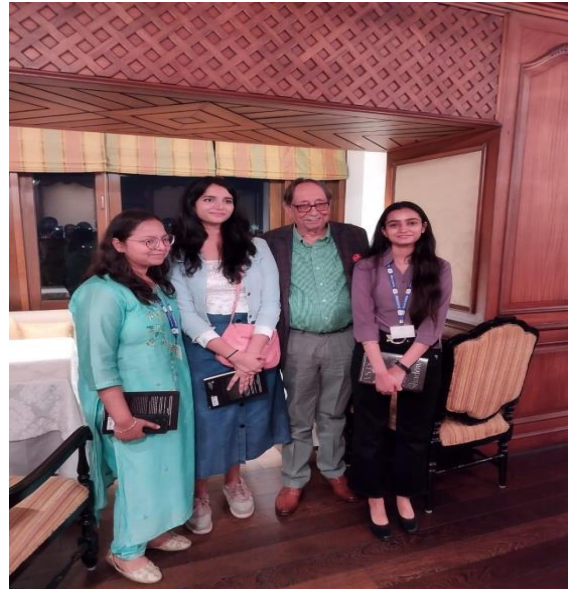
Our students with Amarjit Singh Dulat on February 23, 2023