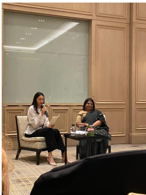
Prabha Khaitan Foundation Programme on November 07, 2022