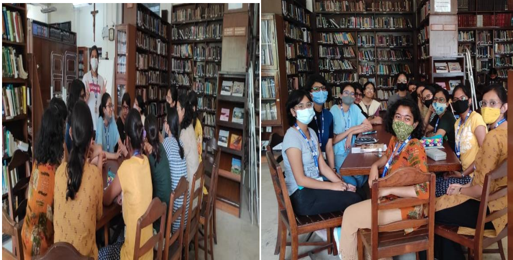
Book Club on April 23, 2022