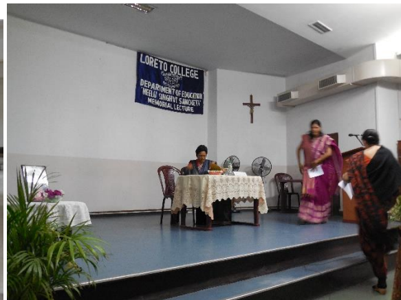
Neelu Sancheti Memorial Lecture