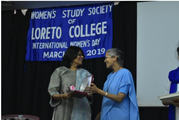
Women's' Day 2019