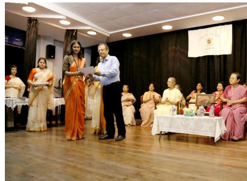
Awards Ceremony 2018