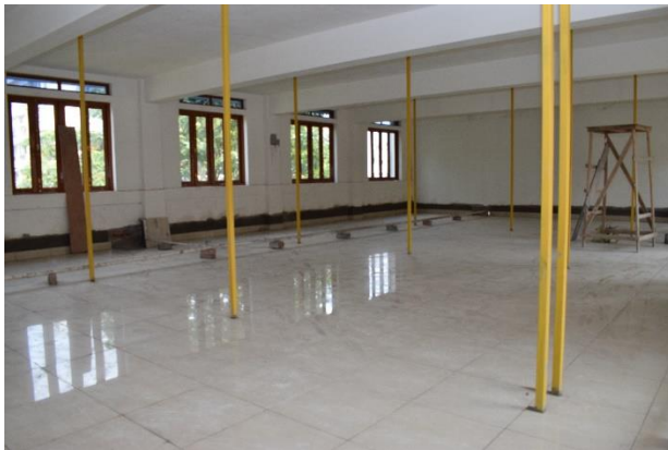
New Construction – Part B