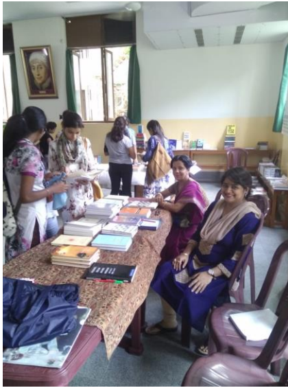
Book Fair 2018