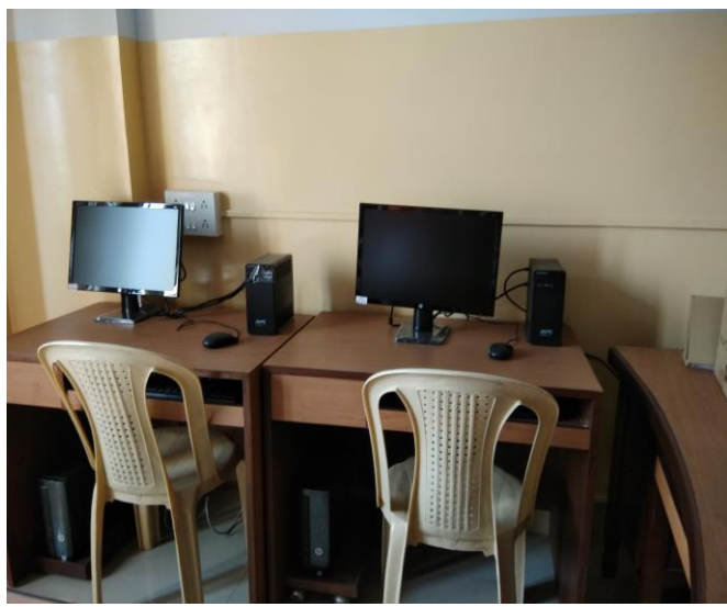
Smart Board Classroom