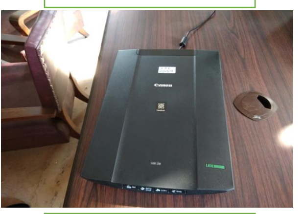
Library - Scanner