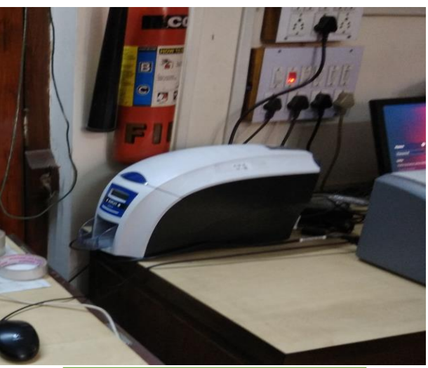
Bar Code Machine